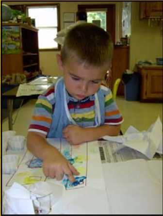
Creative Expression in the classroom

Maria Montessori believed that education should be an aid to life. Among the needs of a young child, she emphasized the need to move and manipulate, to develop language skills, to use all the senses, to become independent, to have love, security and discipline. The Montessori classroom is specifically designed to address each of these needs.