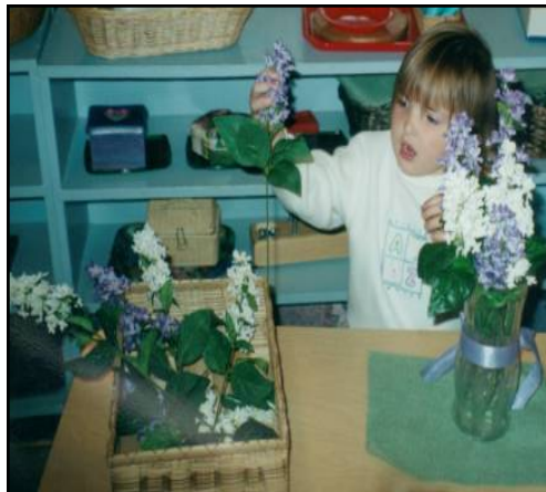
Creating beauty in the classroom

Since 1970, Sunshine Acres has been serving Lawrence and the surrounding communities with a quality program and has provided care for more than 4,000 children in Douglas County.